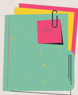
Important Documents in Water-safe Bags