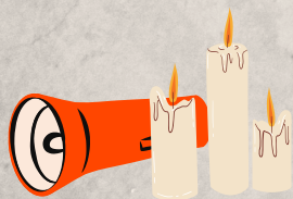
Flashlight & Candles