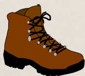
Sturdy Shoes & Clothes